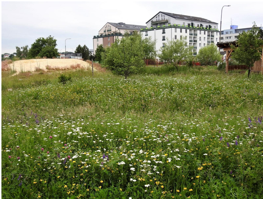
Fig.5: Faculty garden – current state.