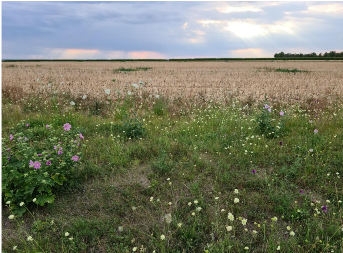
Fig. 8. Field margin sown with 49 wild plant species begin of April 2011. Flowering aspect mid-July 2022. May-mown variant. Precipitation 2022: May 34mm, June 26mm.