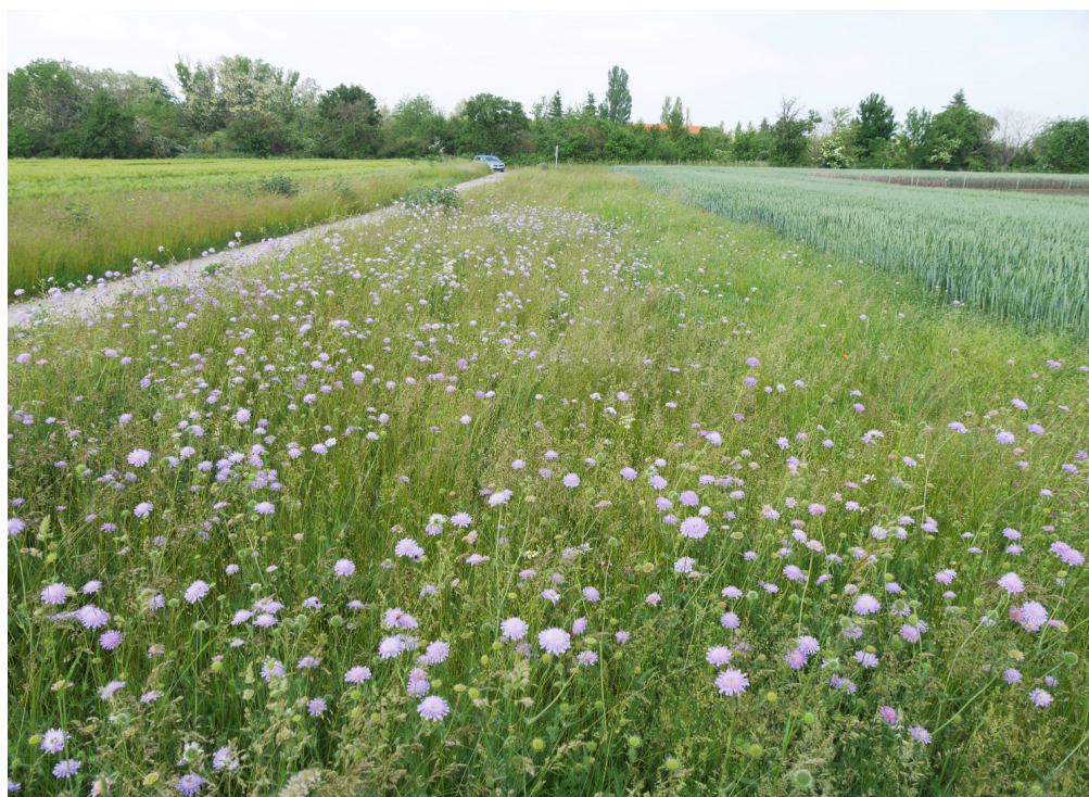
Fig. 5. Field margin sown with 49 wild plant species begin of October 2010. Flowering aspect end of May 2021. June-mown variant.