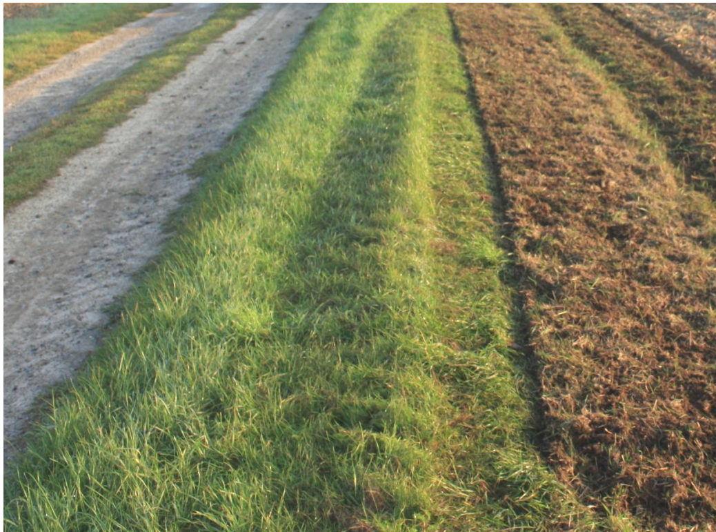
Fig. 1. Grass-dominated field margin before site preparation and sowing in August 2010.

We highly encourage you to submit at least one project photo that we can feature. Photos can include: before/after sequences showing the extent of recovery; use of the restored site by native species; people conducting restoration activities; or the connection between the project and local communities. Upload your photo(s) below, and use the space provided to specify a short caption and appropriate photo credits for each. By submitting your photos, you give SER permission to use them in SER communications (electronic, print) with proper attribution.