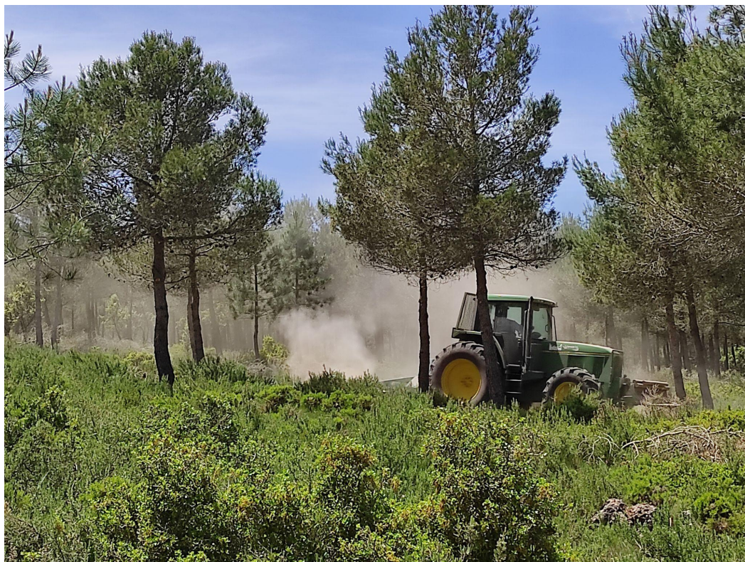
Figure 3. Park like forests ('bosques adehesados') were promoted in some areas by clearing the dense shrubland, and thinning and pruning trees. Chain brush cutter mowers were used when feasible to clear the shrubland and ground felled branches.