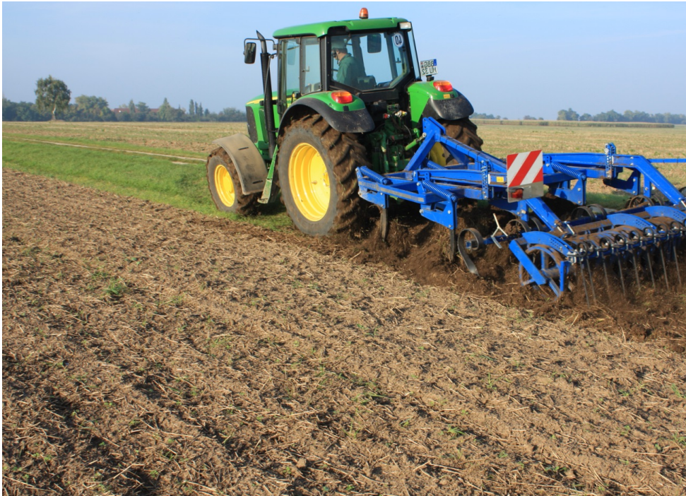
Fig. 2. Site preparation on species-poor grass margins in September 2010 before sowing begin of October 2010.