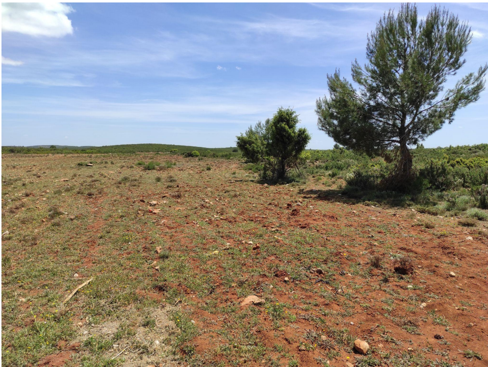
Figure 2. This abandoned farmland was ploughed to favour grasslands and create fuelbreaks.