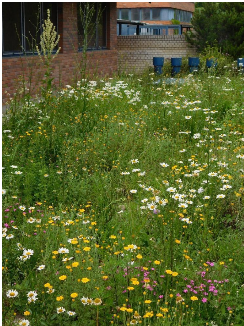
Fig.2: Flowering strips after 2 years (2018)