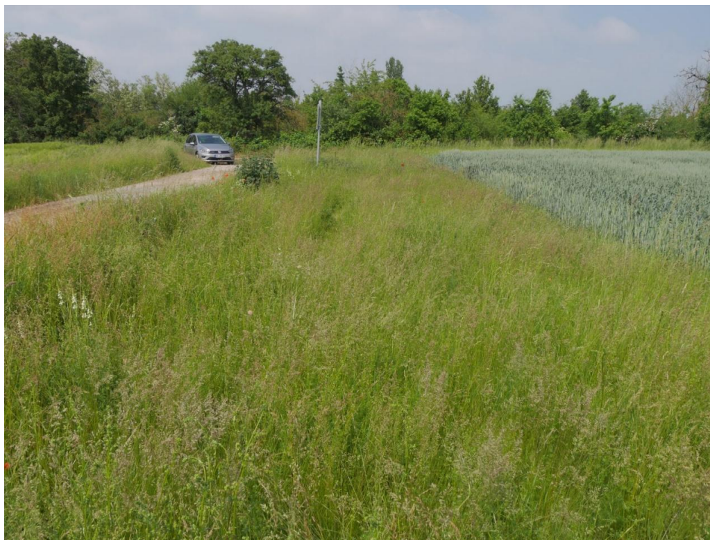
Fig. 6. Field margin sown with 49 wild plant species begin of October 2010. Flowering aspect end of May 2021. September-mown variant.