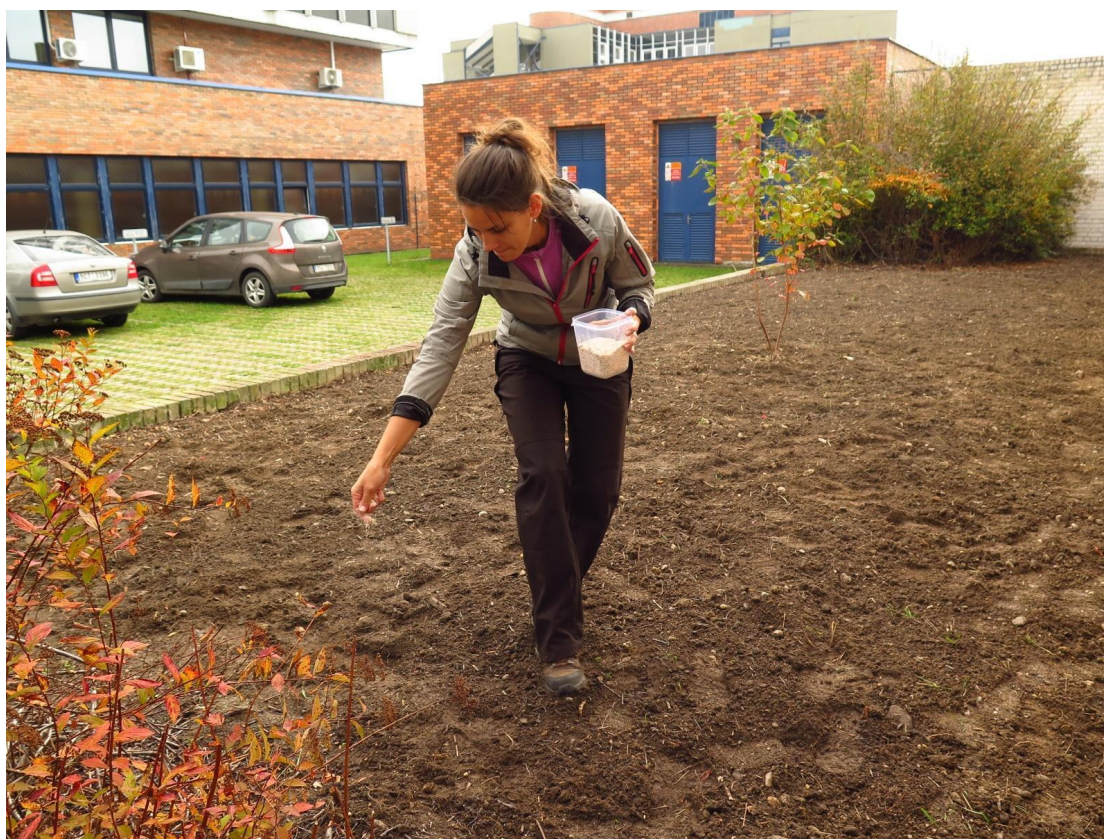
Fig.1: Flowering strips - establishment (2016)