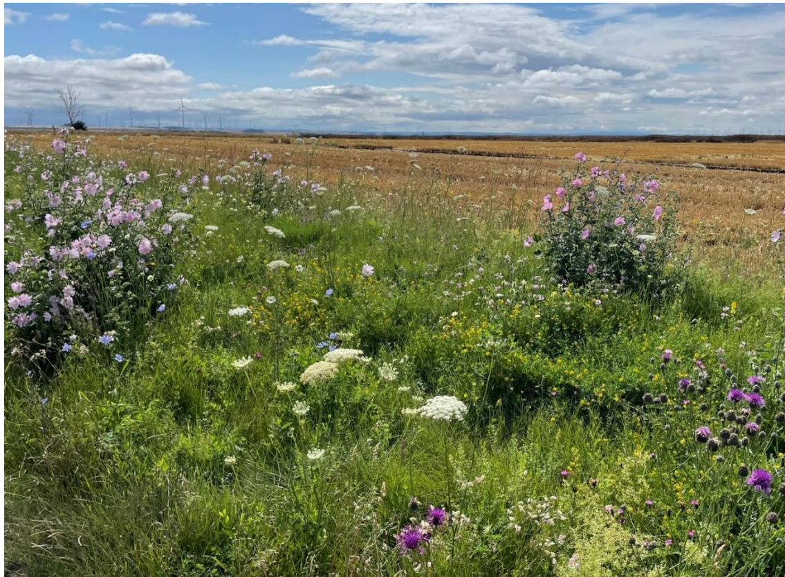
Fig. 7. Field margin sown with 49 wild plant species begin of April 2011. Flowering aspect mid-July 2021. May-mown variant. Precipitation 2021: May 46mm, June 74mm.