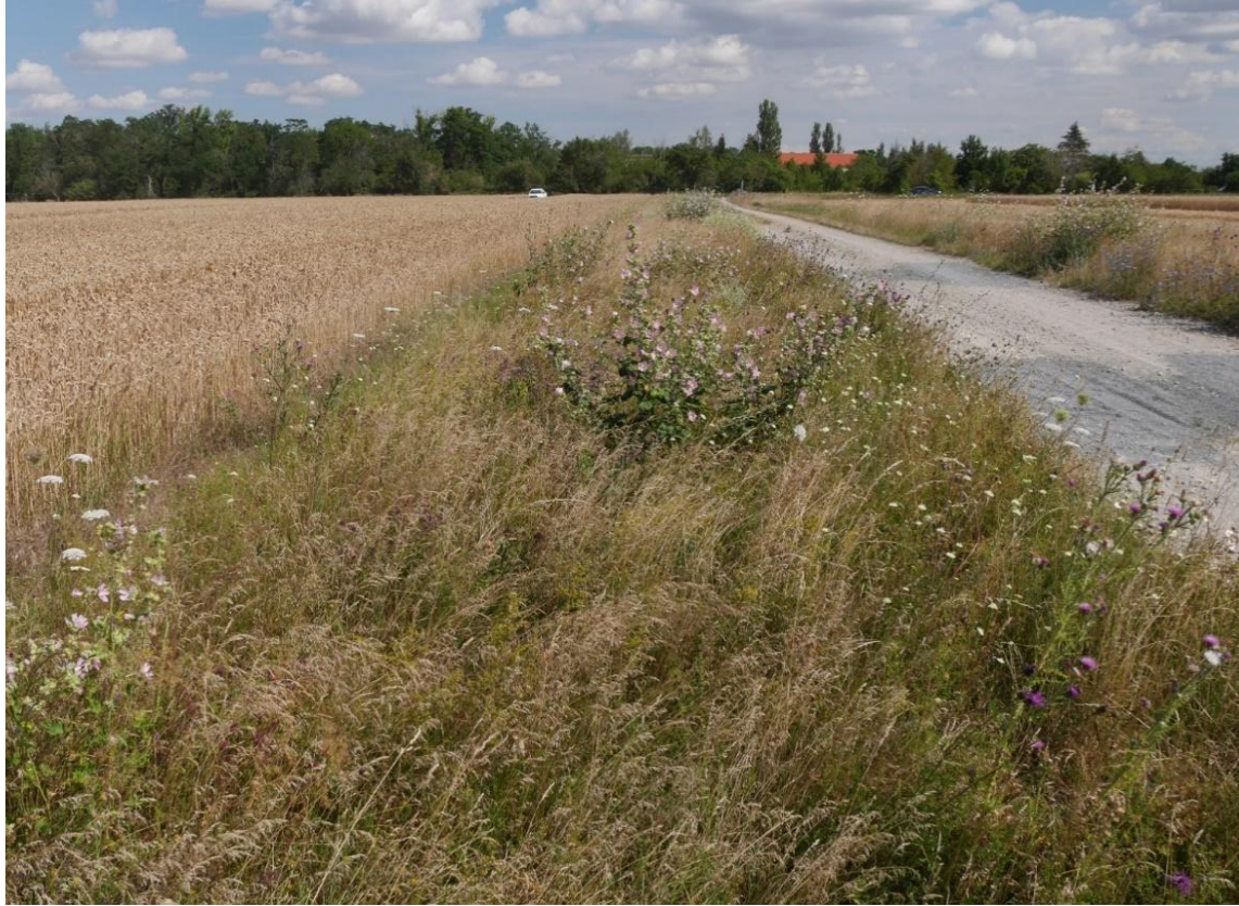
Fig. 10. Field margin sown with 49 wild plant species begin of April 2011. Flowering aspect mid-July 2021. September-mown variant.