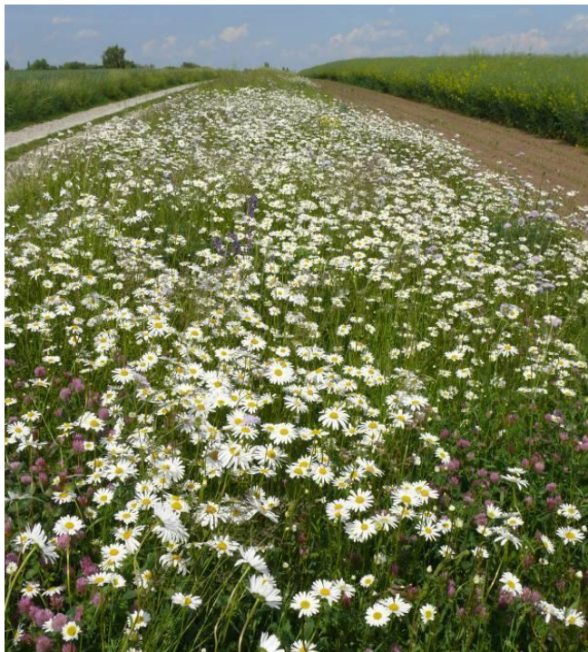
Fig. 3. Field margin sown with 49 wild plant species begin of October 2010. Flowering aspect end of May 2014. June-mown variant.