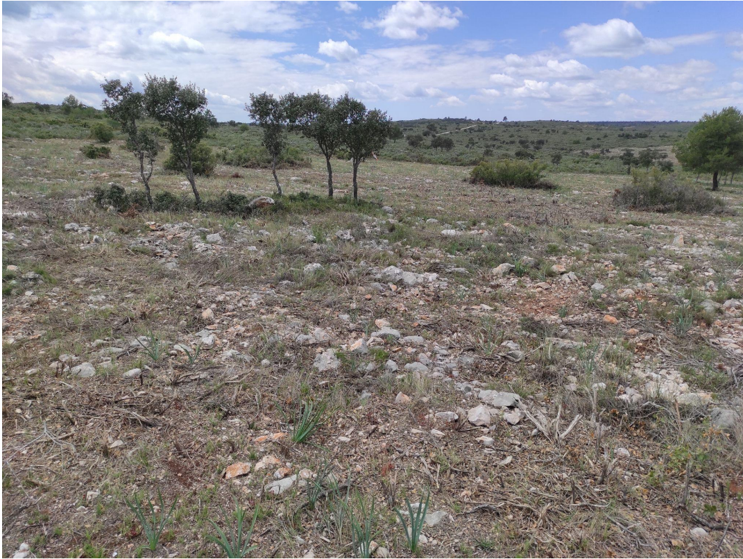
Figure 1. Cleared shrubland in Muela de Cortes y El Carroche ZEC. Only a few shrubs and tree patches have been left to promote grasslands and create fuelbreaks, while creating refugia for small fauna. Trees in the foreground are thinned and pruned Holm oaks.